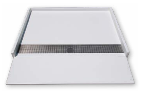
ADA Compliant Ramp