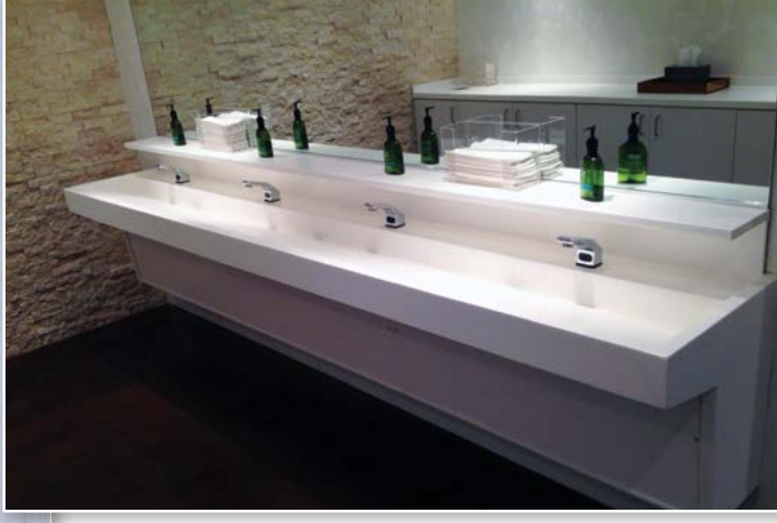
Shown: ADA-compliant shower and vanity top.