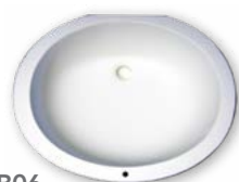
B06 17" x 14" x 5-1/4" Deep Bowl with optional overflow