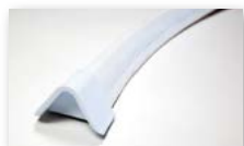
CWR Collapsible Water Dam 42", 48", 66" length