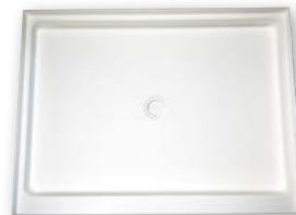
SP3648 Solid Surface Shower Pan