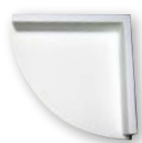
CD0707 Corner Soap Dish