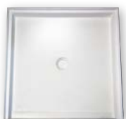
ADA3636 Solid Surface Shower Pan